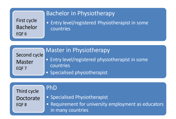
Fig 1. Schematic overview of levels of education and corresponding qualifications which may vary across nations. Levels indicated according to the European Qualification Framework (EQF).

A way to facilitate an early research career may be to promote master programmes that are more focused on developing research methodology and to pursue the route of a research career. Strengthening the relationship between research, teaching and innovation is also important in a perspective of lifelong learning. Universities' research and innovation missions can be strengthened through lifelong learning strategies, and universities' specific contribution to lifelong learning should be underpinned by research. Researchers should also be recognised as good examples of lifelong learners whose own educational needs are continually evolving, and taking account of the changing skills required by the labour market. Lifelong learning can also be a source of new research methodologies and topics (European Universities' Charter on Lifelong Learning, European University Association).